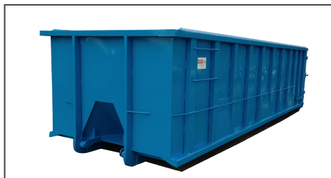
Heavy Duty Open Top Roll Off