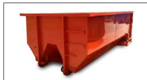
Heavy Duty Tub Style Roll Off