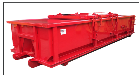
Single Roof Sludge Box