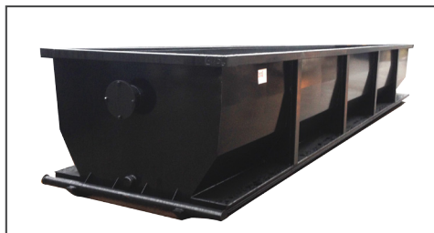
Half Round Mixing Box