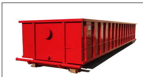
Rectangular Mixing Box