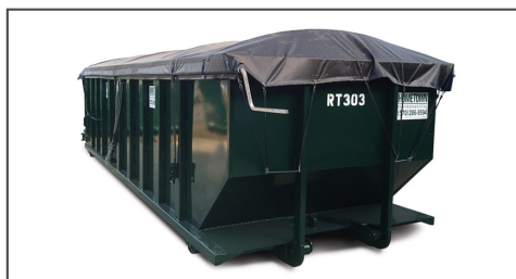
Sealed Gate Tarp Roll Off